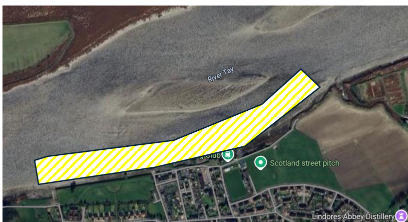
Newburgh – between California and Linoleum Slipway

Mariners are advised to keep clear of the survey operations.